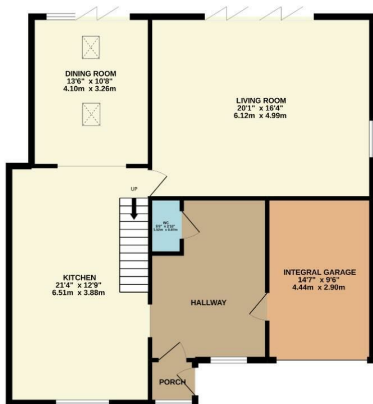
GROUND FLOOR 1053 sq.ft. (97.8 sq.m.) approx.